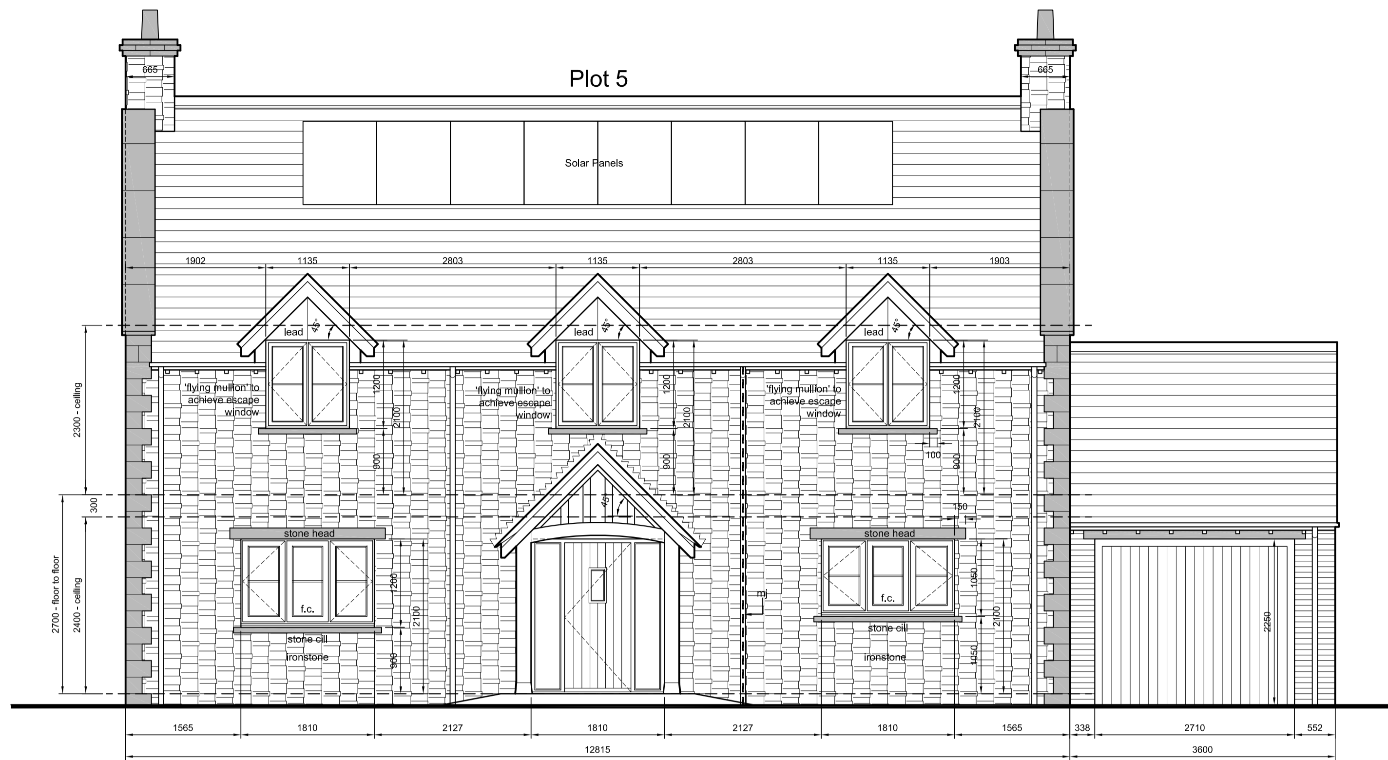
Proposed Front Elevation (South East) Scale 1:50 @ A1 / 1:100 @ A3