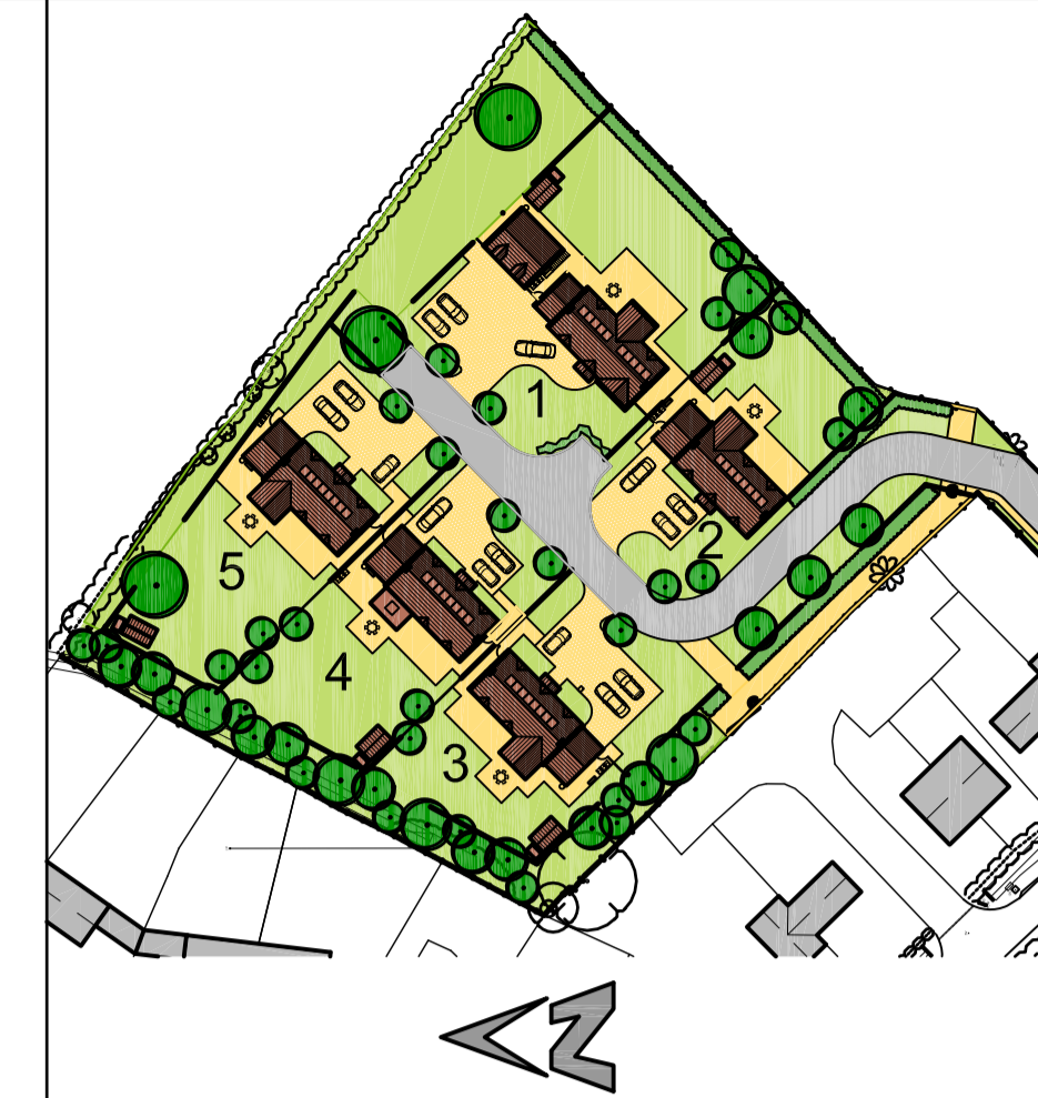
Proposed Site Plan Scale 1:1000 @ A1 / 1:2000 @ A3