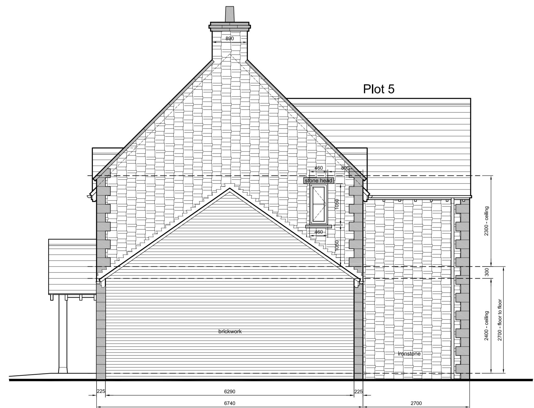
Proposed Side Elevation (North East) Scale 1:50 @ A1 / 1:100 @ A3