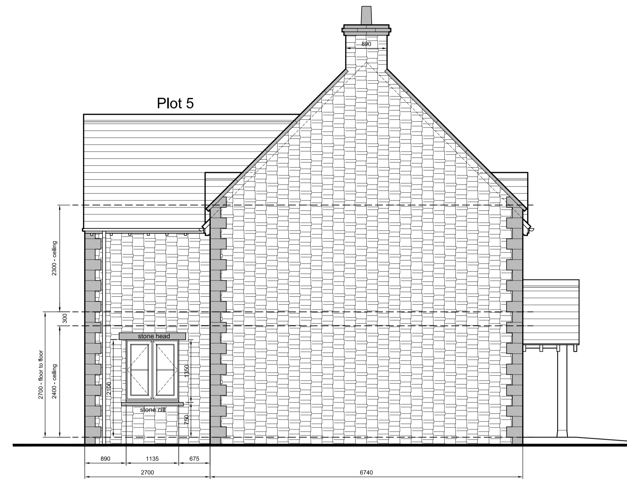
Proposed Side Elevation (South West) Scale 1:50 @ A1 / 1:100 @ A3