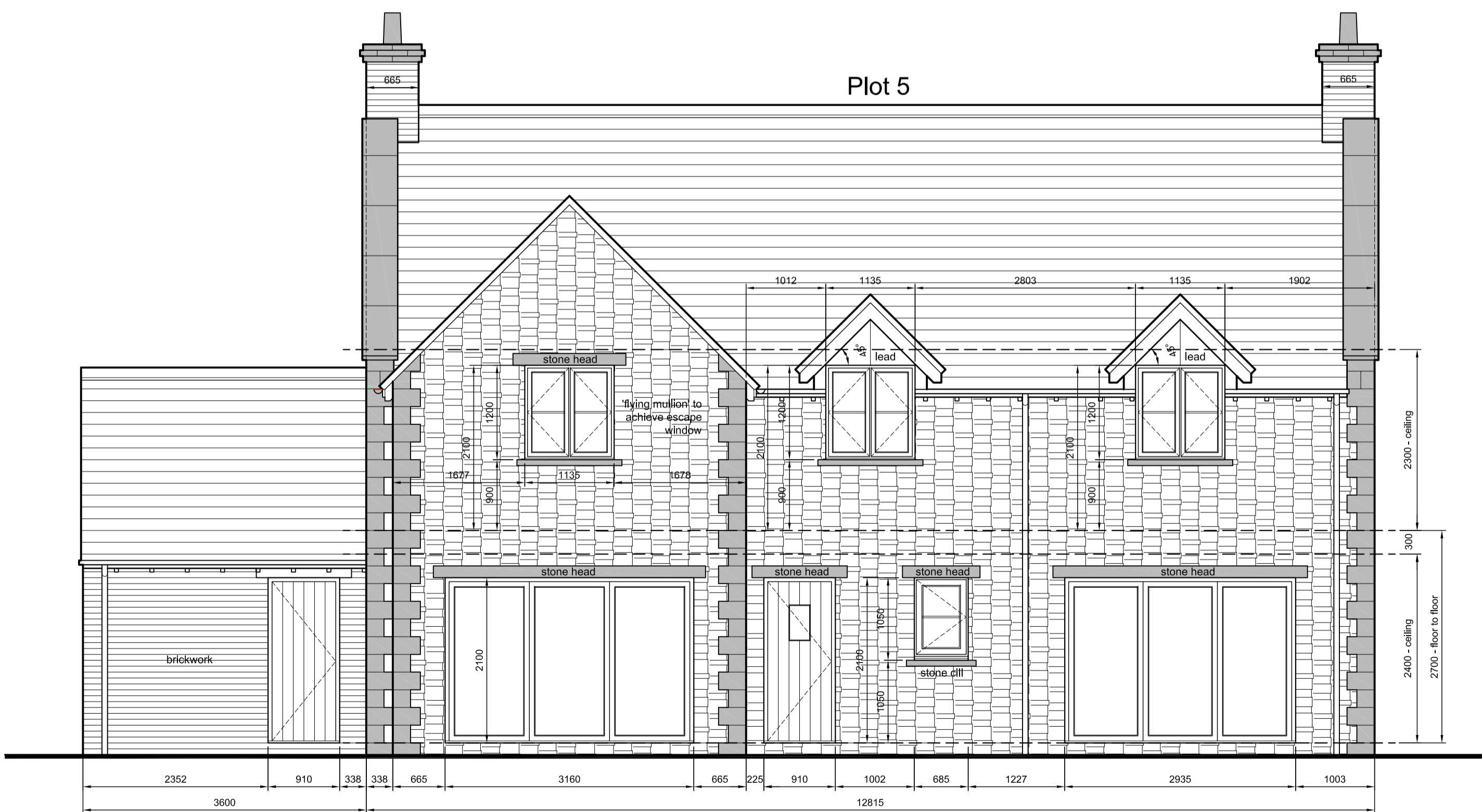
Proposed Rear Elevation (North West) Scale 1:50 @ A1 / 1:100 @ A3